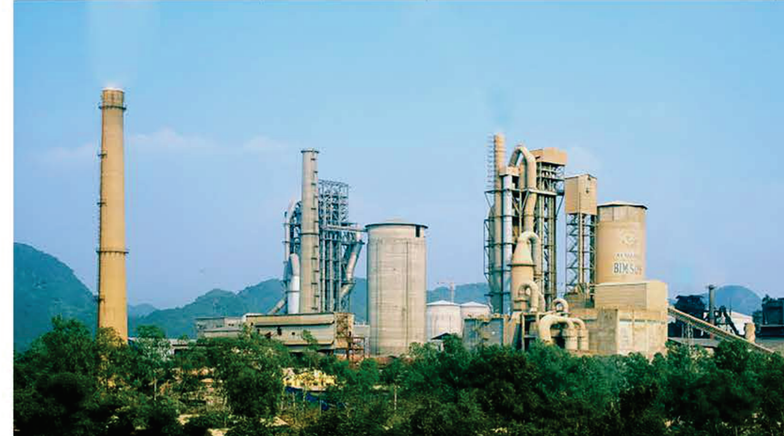
Bim Son cement Factory