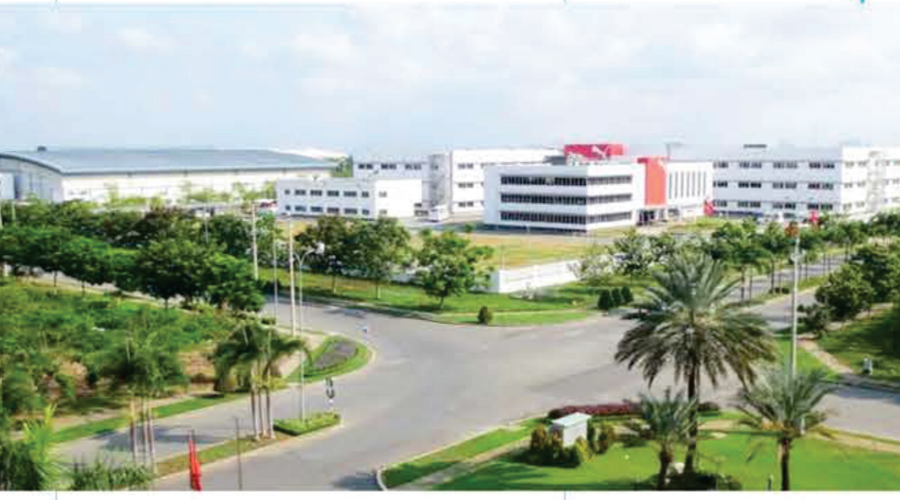
Le Mon Industrial Park