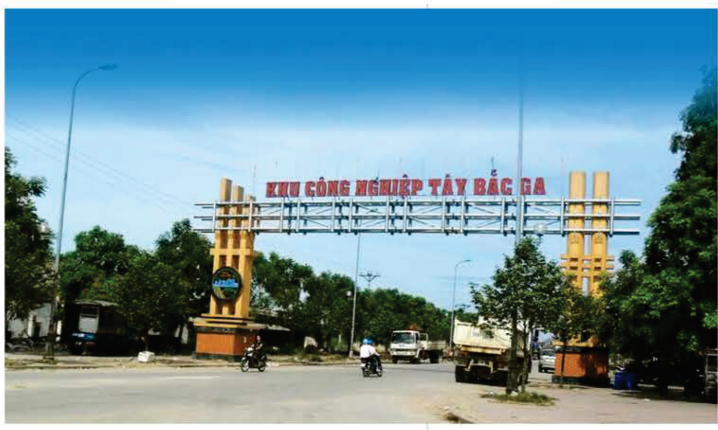
Dinh Huong - Tay Bac Ga Industrial Park