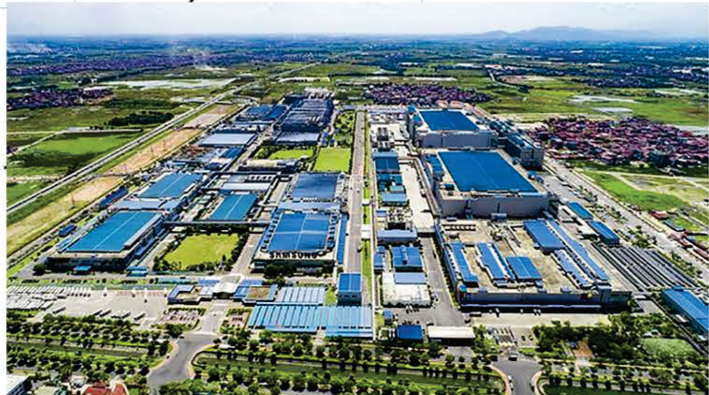
Hoang Long Industrial Park