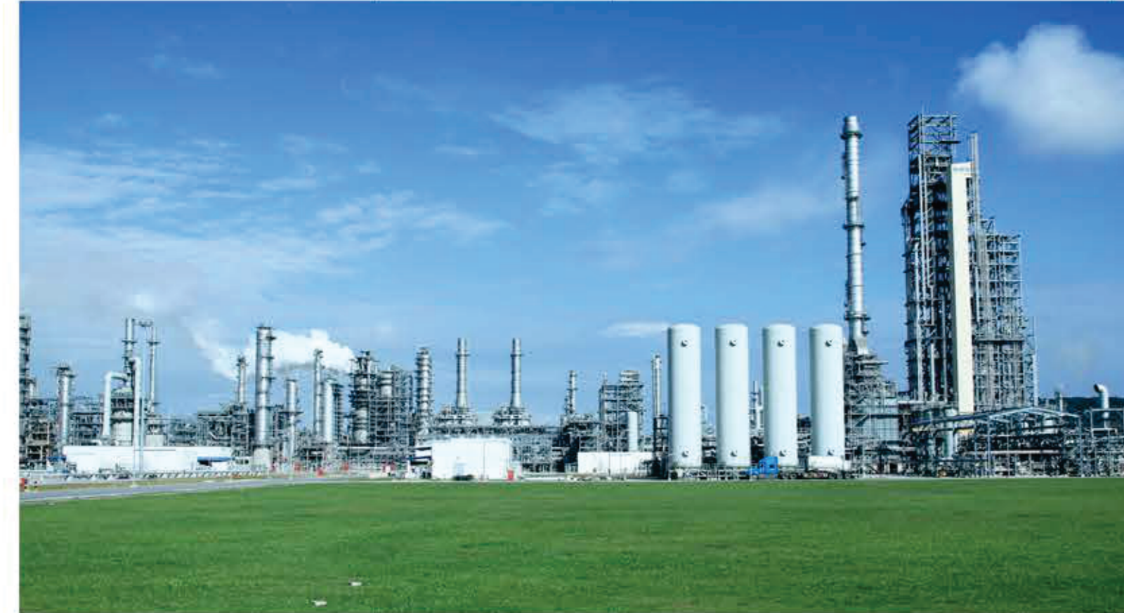
Nghi Son Petrochemical Refinery Plant