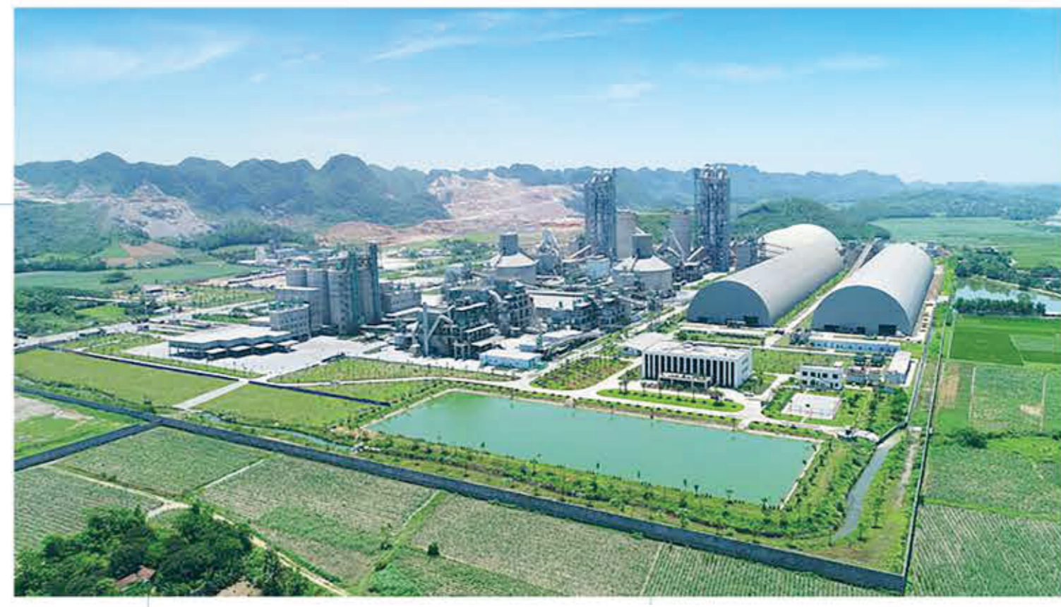
Long Son cement Factory